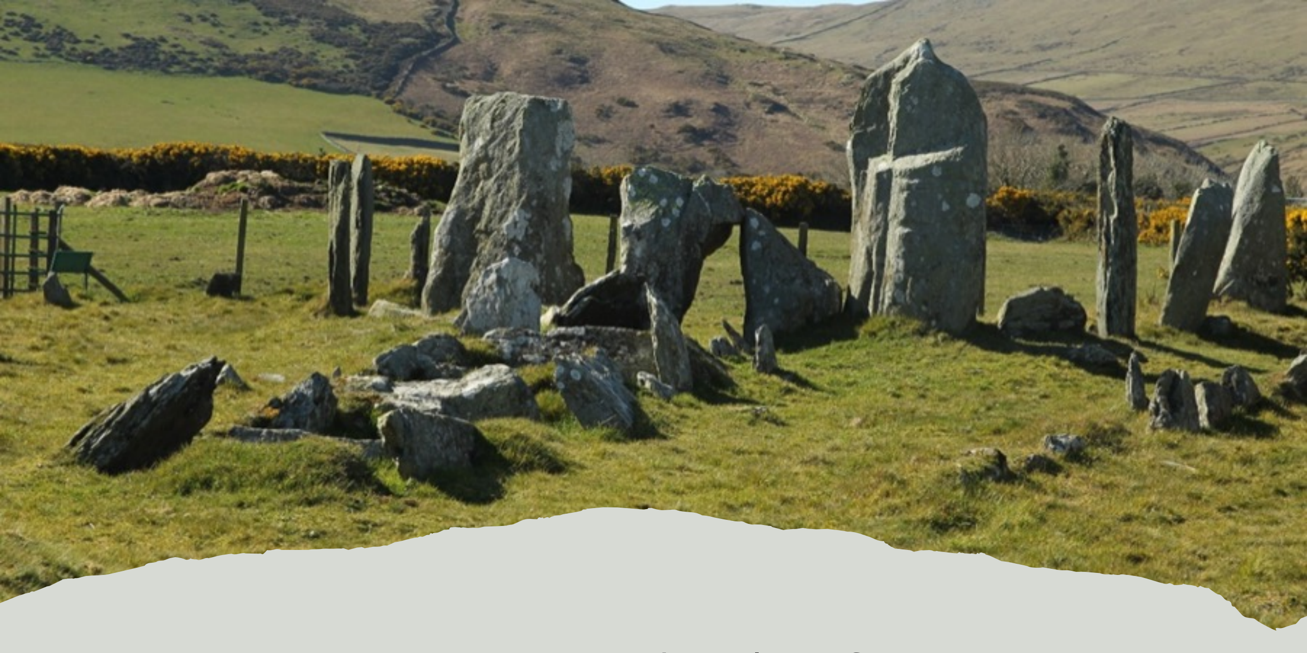
Improving access to Manx archaeology for autistic visitors